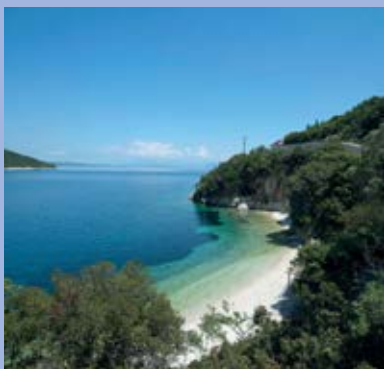
Beach near Frikes

Was Ithaca really the homeland of Odysseus? There are plenty of clues – certain descriptions and places Homer mentions do seem to fit – and it is fun to do a little detective work and see if you agree.