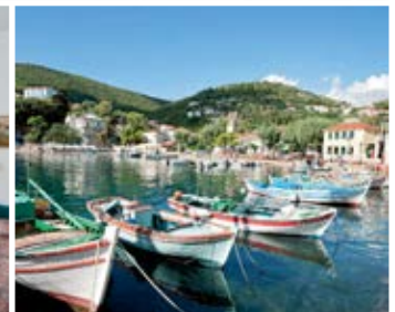
Kyparissa location above the harbour (top left)